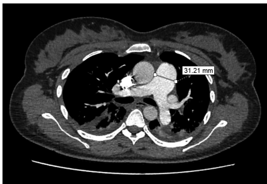
Fig. 2. Computed tomography pulmonary angiogram. Dilated pulmonary trunk (31.2 mm; normal value 27 mm in females) and both pulmonary arteries. No obvious signs of proximal thrombosis. Mild bilateral pleural effusion.

toms occurred (acute dyspnea, desaturation 92%, low blood pressure 80/50 mmHg, sinus tachycardia 120 bpm). Rapid administration of intravenous fluids and proper oxygenation were provided. The course of subsequent events was very rapid. The epidural anesthesia was applied at the stage of 4 cm dilation, and the amniotic fluid passed out during application of the epidural. At the time of circulatory and respiratory disorders of the mother, the fetus developed bradycardia up to 60 beats per minute. After the patient's condition improved and due to imminent fetal asphyxia, an urgent caesarean section was performed. The newborn was delivered in critical condition, assessed of 1-3-4-4 points in Apgar score in 1-3-5-10 minute, respectively. Cord blood gas had the following parameters: pH 6.8, base excess uncountable, lactates -11.7 mmol/l. After birth, 5 relaxation breaths and an assisted ventilation with \text{FiO}_2 max 0.4 were applied. In the neonatal intensive care unit he was intubated and mechanically ventilated. Fetal amplitude-integrated electroencephalography showed several abnormalities. After 2 hours from birth, a decision was made to use therapeutic hypothermia, which was carried out for 3 days. Mechanical ventilation was continued for